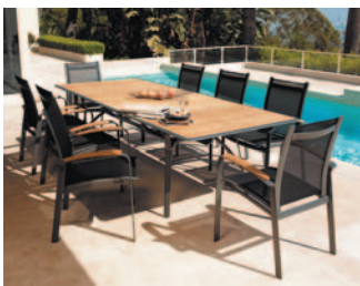
Mixed media pieces combine teak, metal and fabric.

The American Home Furnishings Alliance points to other outdoor furnishing trends including mosaic, tile and stone tabletops as an alternative to glass; high-tech lightweight elasticized "sling" fabrics and removable slipcovers instead of chair and chaise pads and cushions; and complementary accents including outdoor bar trolleys, plant trolleys and throw pillows.